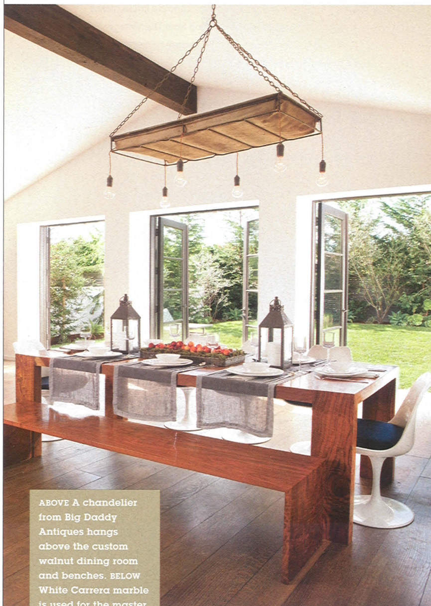
ABOVE A chandelier from Big Daddy Antiques hangs above the custom walnut dining room and benches. BELOW White Carrera marble is used for the master bath's tub. Paintings by Halverson Frazier.

If Eric was looking for a certain familial coziness, however, he didn't want the clutter that goes with it. Instead, he went for a less-is-more look, inside and out. "I worked Garden Studio Design, who ensured that the landscape was beautiful and harmonious with the sensibility of the house," he says. For the interiors, he warmed up the home's clean and contemporary lines with a series of rustic, organic-looking materials that give warmth and character while still keeping it streamlined. In