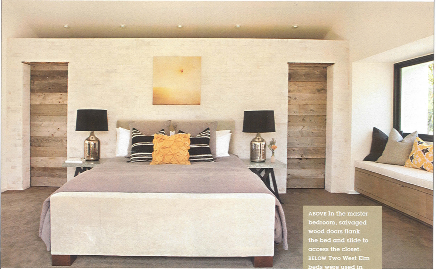
ABOVE In the master bedroom, salvaged wood doors flank the bed and slide to access the closet. BELOW Two West Elm beds were used in the girls' room. The animal photography is by Sharon Montrose.