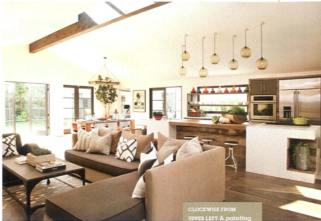
CLOCKWISE FROM UPPER LEFT A painting by Halverson Frazier hangs in the guest room; a view of the great room; landscaping by Garden Studio Design and Dig Landscape Construction.