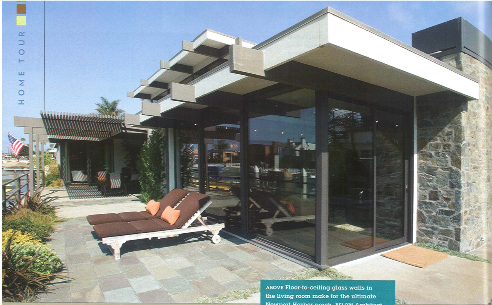
ABOVE Floor-to-ceiling glass walls in the living room make for the ultimate Newport Harbor perch. BELOW Architect Eric Olsen used reclaimed wood to create banquette seating in the dining room.